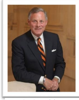
Sen Richard Burr (R) 202 224 3154 217 Russell Senate Ofc Bldg Washington DC 20510 burr.senate.gov/email-me 6 yr term ends January 2023