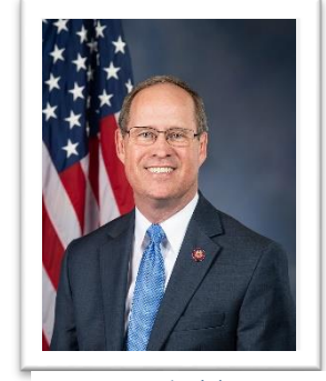
Rep Greg Murphy (R) 202 225 3415 313 Cannon HOB Washington DC 20515 gregmurphyforms.house.gov/contact/ 2 yr term ends January 2023