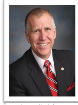
Sen Thom Tillis (R) 202 224 6342 113 Dirksen Senate Ofc Bldg Washington DC 20510 Tillis.senate.gov/email-me 6 yr term ends January 2027