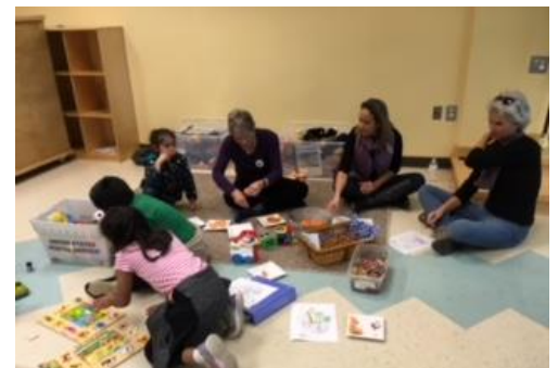
Children's Play Corner at the Care Faire