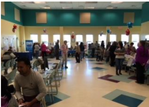
January 21 Community Care Faire at Nags Head Elementary School

On January 21, we held the Community Care Faire at Nags Head Elementary School, partnering with Mano al Hermano. Highlighting the resources available in Dare County for anyone in need, over 15 organizations participated! Each described their services, each had a representative available to enroll folks or to answer specific questions. We welcomed well over 120 attendees during this 3-hour event and the general take away was that it was a huge success! The effort was